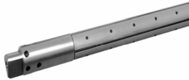
Shaft Type „S“ with LEAF'S