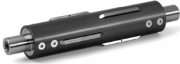
Shaft Type „K“ with LUG'S