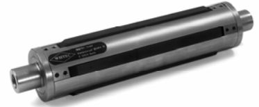
Shaft Type „L“ with SLAT'S